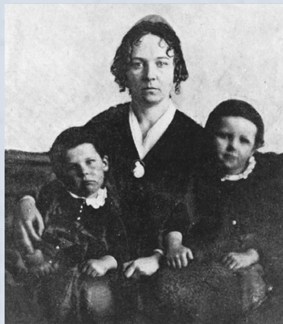
Elizabeth Cady Stanton around the time of the Seneca Falls Convention.

British abolitionists issued an invitation to "friends of the slave in every nation" for a World Anti-Slavery Convention. An American delegation included Elizabeth Cady Stanton—on her honeymoon—and Quaker activist Lucretia Mott. Women were seated separately and William Lloyd Garrison sat with them in protest. Shocked at the "narrow minded bigotry" of celebrated reformers, Cady Stanton made women's rights a life-long priority.