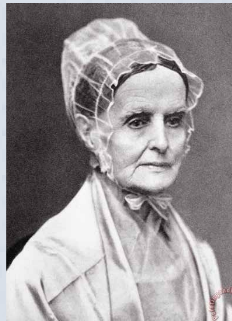
Lucretia Mott became a mentor and inspiration to the younger Cady Stanton.